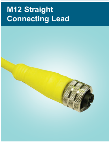
M12 Straight Connecting Lead