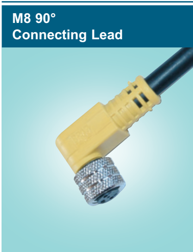
M8 90° Connecting Lead