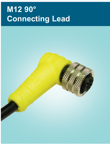
M12 90° Connecting Lead