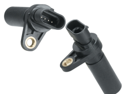
SD1012 Series Sensor