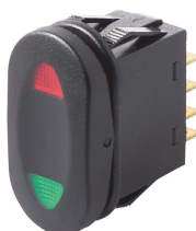
KM Series Rocker Switch