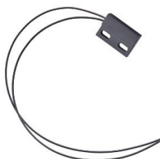
MP2019 Series Magnetic Switch