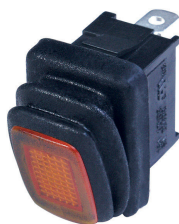
KR Series Rocker Switch